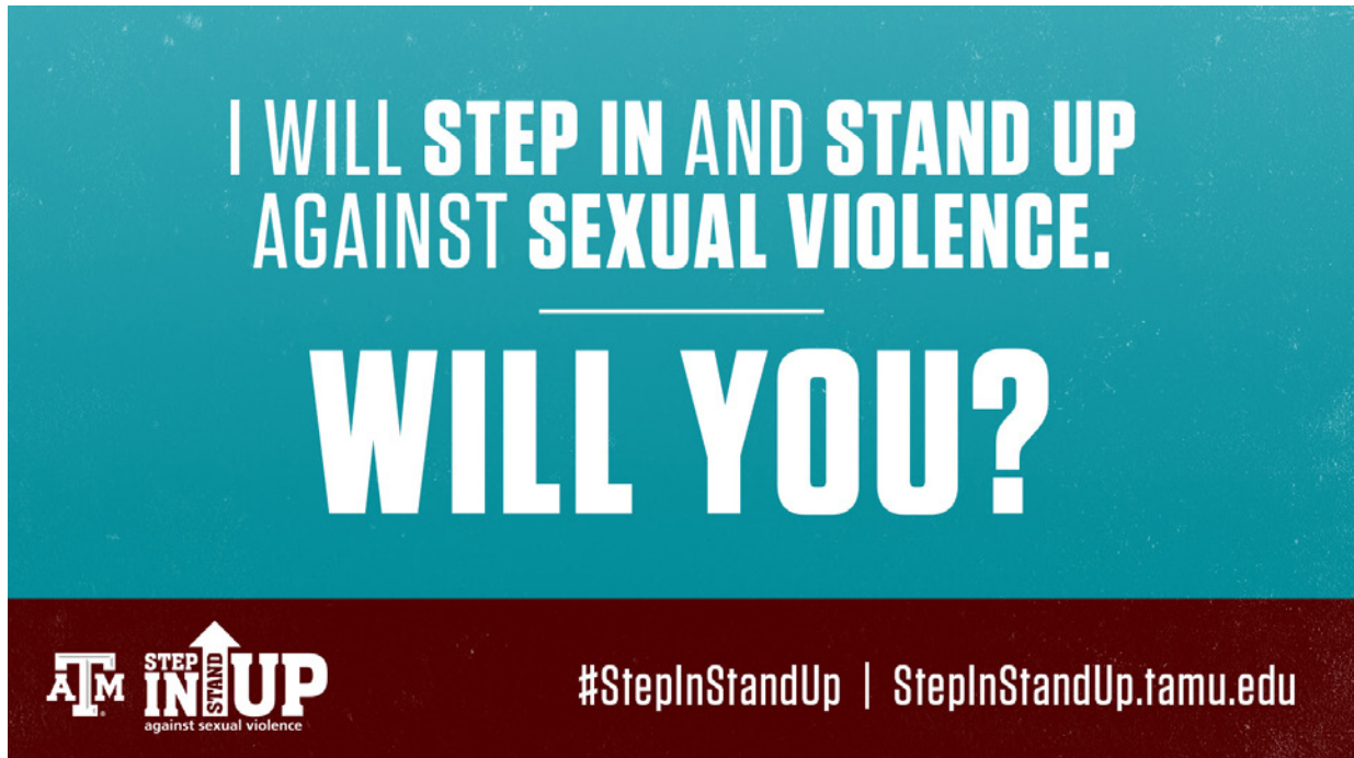
Shareable social media graphic